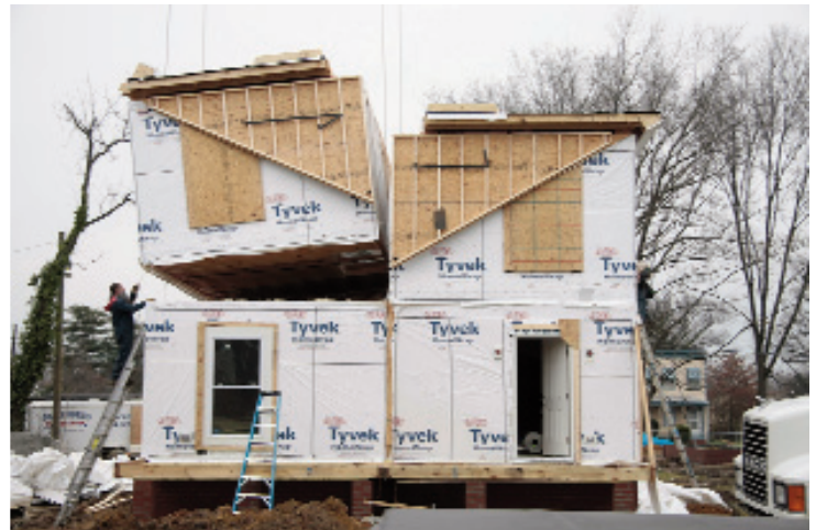
Systems Built home currently being constructed on Maury Street to advance RRHA’s public housing replacement efforts.

RRHA is using an innovative construction approach, Systems Built Construction, for the development of these homes. Systems Built homes are developed in sections in a controlled indoor environment to the same building codes as site-built homes and delivered to the site up to 90 percent complete, for the setting and finish work. State-of-the-art pro-