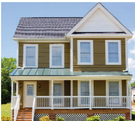
Parade of Homes Blue Ribbon Award winner for “Open Floor Plan” in the Blackwell Community.

residents, the RRHA staff, business partners, the City of Richmond and the U.S. Department of Housing and Urban Development in providing quality, affordable housing and effective neighborhood revitalization and commercial redevelopment.” IF