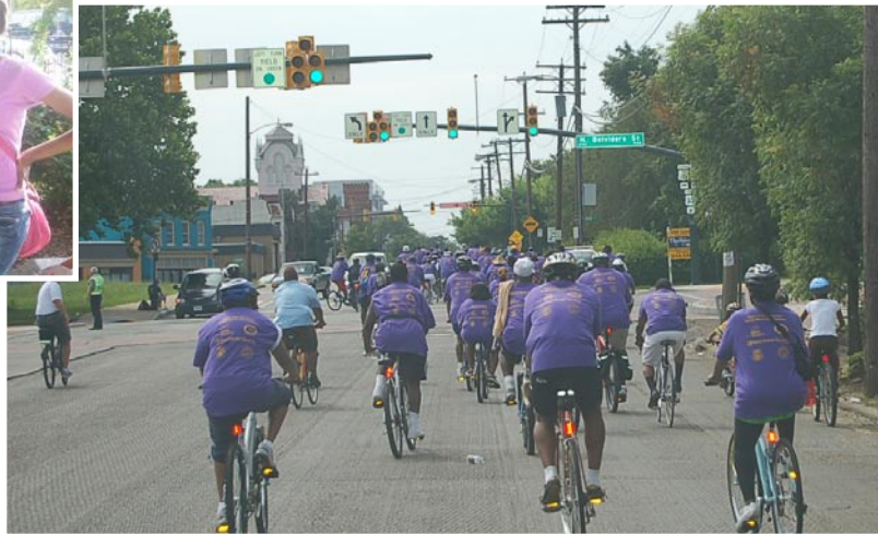
Bikers in the home stretch as they ride along Leigh Street.

“While the event is fun and enjoyed by everyone who participates, it also gives us an opportunity to spread the message of bicycle safety, crime prevention awareness and a