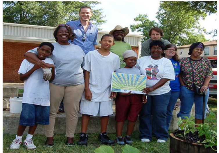
Pictured are members of the Hillside Court Girl Scout Troop and volunteers who participated in the barrel planting project.