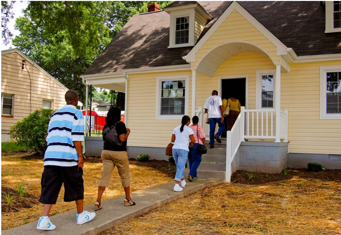
Potential homebuyers tour NHI home on Winder Street in the Randolph Community.

owning their own home. RRHA is encouraging homeownership through its comprehensive neighborhood redevelopment efforts, which are bringing the development of nearly 800 affordable homes in RRHA neighborhoods. Additionally, RRHA offers homebuyer education programs (see side bar) and services, through The HomeCenter, the one-stop-shop for information, counseling and resources; along with homeownership benefits and incentives such as down payment assistance and grants.