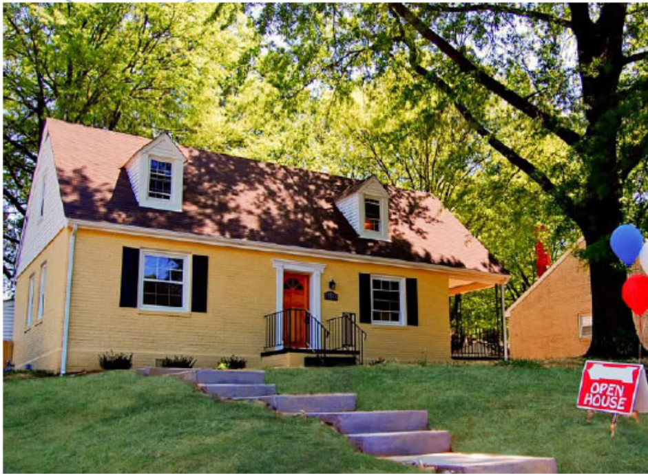
RRHA model home on Lombardy Street. The home recently sold.

R RHA celebrated and promoted homeownership during June's National Homeownership Month. RRHA incorporating The HomeCenter, the HOPEVI Revitalization Program, the HCVP Self-Sufficiency and Homeownership Program, along with its partners hosted a day of activities to promote homeownership in RRHA neighborhoods and opportunities available through RRHA programs and services. Dozens of people participated in activities that included: