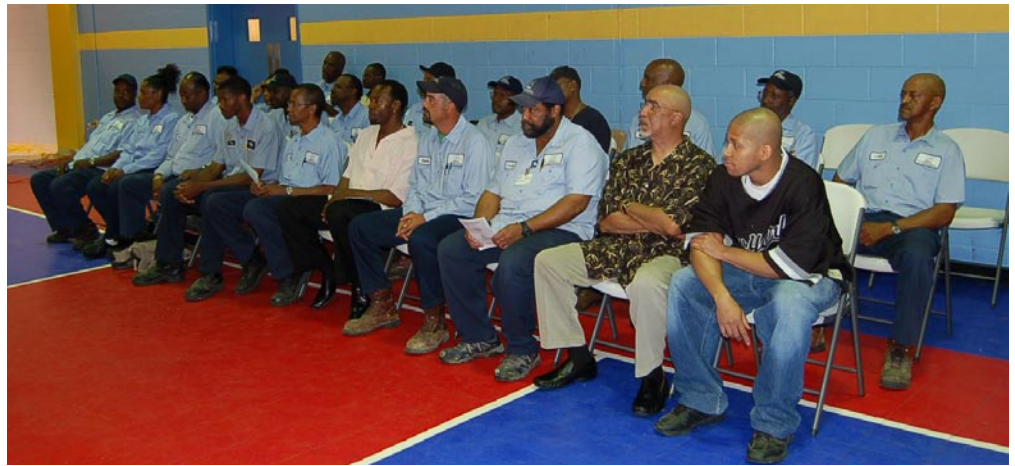
Graduating class listens as speakers impart words of wisdom and encouragement.

C ongratulations to the 33 RRHA maintenance staffers who graduated during the May Agency-wide Business Meeting after completing maintenance training. Graduates received certificates, which now qualify them as maintenance specialists. The following is a list of the very first maintenance specialists graduating class. Employees received framed certificates and were personally congratulated by