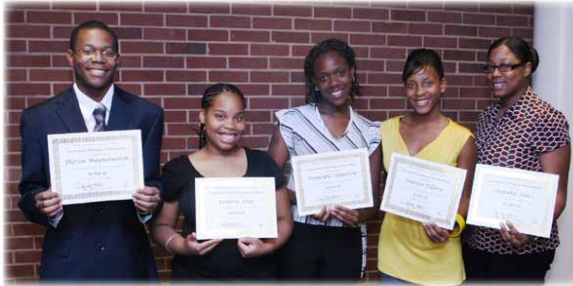
Award recipients proudly display their certificates.